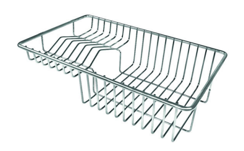
Stainless steel plate rack 8100 304